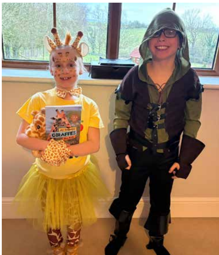
Fabulous World Book Day costumes