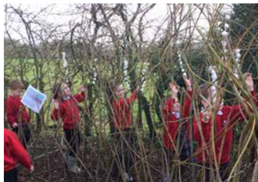
After following a trail around the sensory garden, they discovered a bear in his cave hiding in school! Lots of fun and adventures were had.